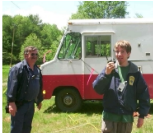
Left: NHOEM communications van; Above: N1ZIH & KB1GSA in front of N1IIC's communications van