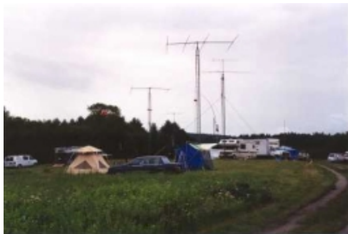
Here's what the 2001 CVRC Field Day site looked like. If you're interested in attending or planing for Field Day this year be sure come to the April meeting!